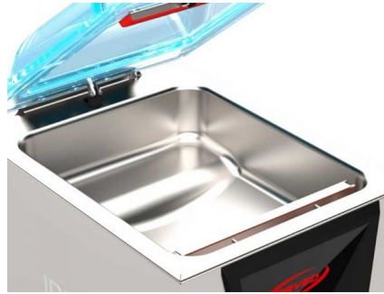
Heavy duty vacuum chamber