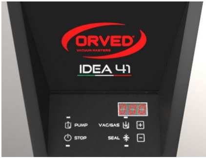
Digital control panel