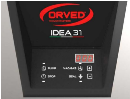
Digital control panel