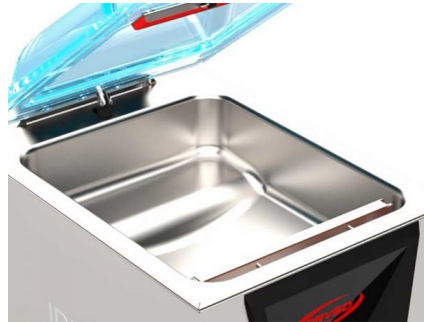
Heavy duty vacuum chamber