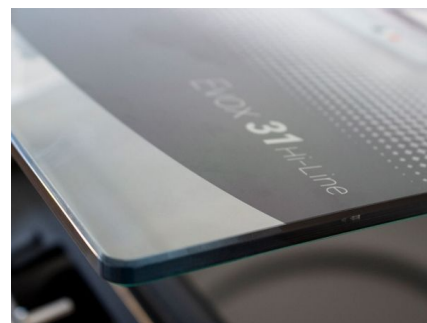
Modern Italian design