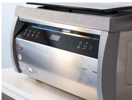
Touch control panel