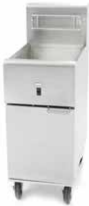
SR114E Shown with optional casters.