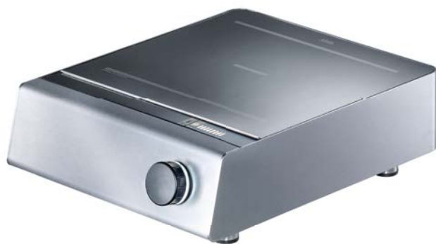
INSTINCT Hob 3.5/5